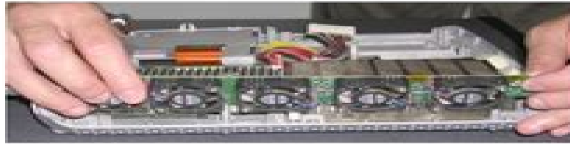
Figure 8-67 Removing the Fan Assembly