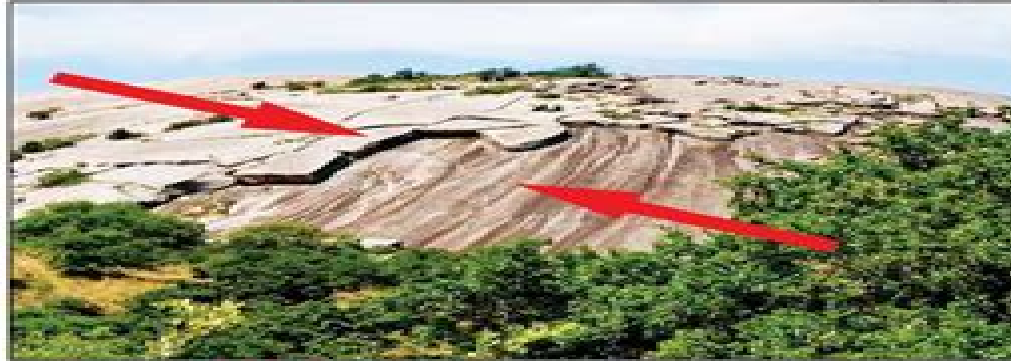
Figure 2.15 Exfoliation domes

The effects of temperature changes: The temperature variation between day and night causes rock to expand and to contract. This process causes cracks to develop. In time, the cracked layer peels off and falls to the ground. This process is called exfoliation (see Figure 2.15).