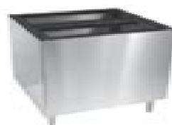
IOBDM S22 & IOBDM S30