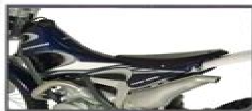
Version Long Ride / Long Ride version / Versione Long Ride / Versión Long Ride