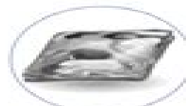
APPROX. CUBE SIZE: 1 1/4" x 1 1/4" x 1/2" THICK