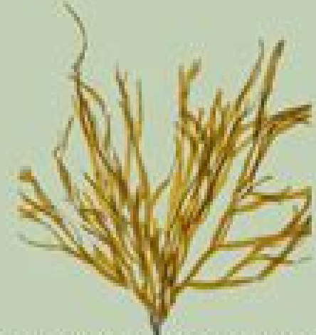
Brown Algae (Phaeophyceae)