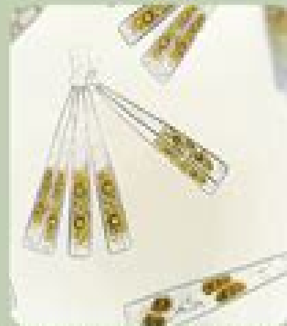
Golden Algae (Chrysophyceae)