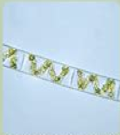
Green Algae (Chlorophyta)

Algae are a diverse group of photosynthetic, primarily aquatic organisms.