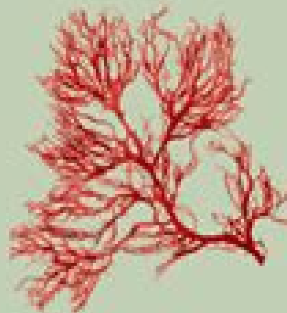
Red Algae (Rhodophyta)