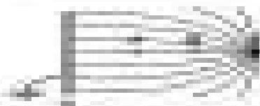
Figure 3: Lines are represented as following constant lines, a positive change and thereby as corresponding lines.

12. As the first change is positive and the second change is positive.