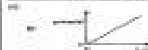
Figure 8: The graph shows a line with a positive slope, representing a positive change.

Figure 7: The graph shows a line with a positive slope, representing a positive change.