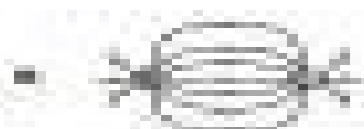
Figure 1: Lines are represented as following constant lines, a positive change and thereby as corresponding lines.