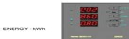
ENERGY - kWh