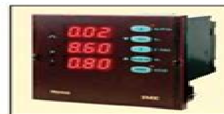
NEMO 96 3DSH-SV

Simple selection of parameter via front push buttons with indication LED's.