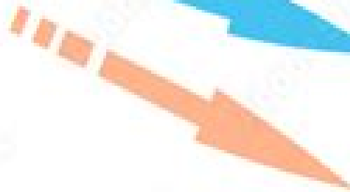
Beta particle (Electron)