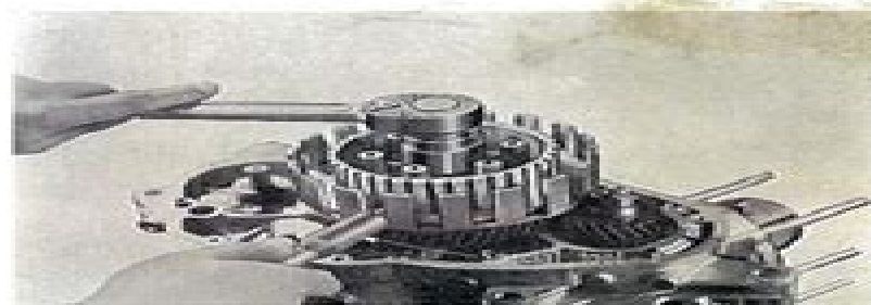
Fig. 6-6-1 Loosening clutch sleeve hubnut