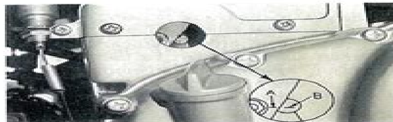
Fig. 6-5-3 Oil pump inspection marks