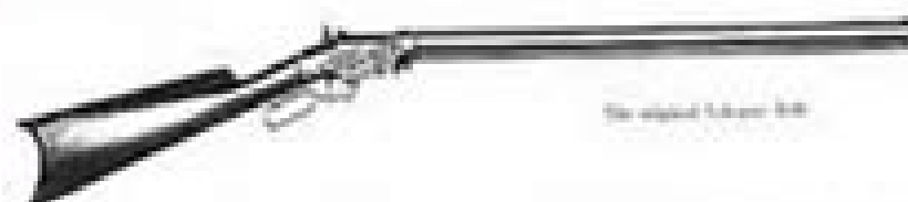
The original Winchester rifle

The Winchester rifle, originally sold in New Haven, Conn., is the only rifle maker in the world. It is the only rifle maker in the world.