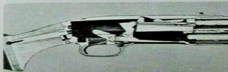
Model 12 Field Gun (Action Closed)