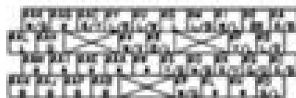
FIG. 1-11 PCM