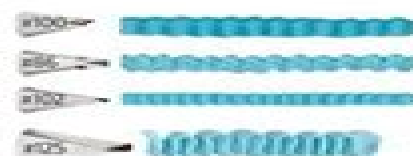
Ruffles Tip Set