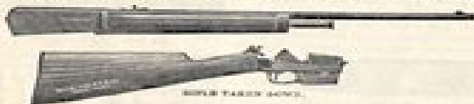
To Take Down The Gun.

Instructions For Using Model 1905 Self-Loading Rifles.