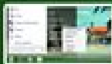
Watch and enjoy your music