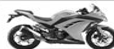
How to Remove the Rear Wheel