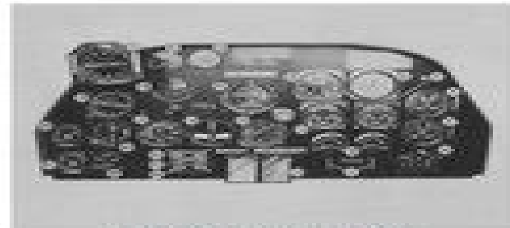
TYPICAL INSTRUMENT PANEL P-38A-25 Panel Diagram