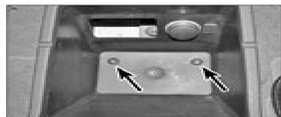
27.9 Undo the 2 Torx screws in the storage box (arrowed)

9 Lift up the rubber mat in the storage box, and undo the 2 retaining screws (see illustration).