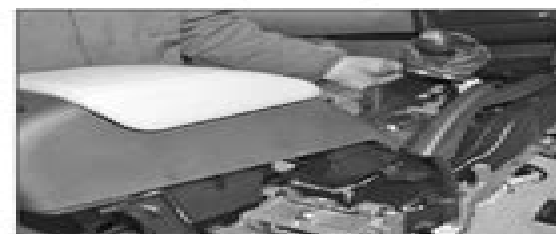
27.11b Lift the rear of the console and manoeuvre it from place