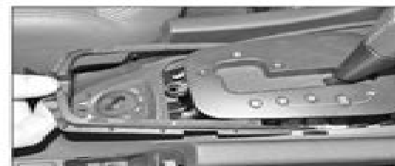
27.6b . . . and slide out the retaining frame