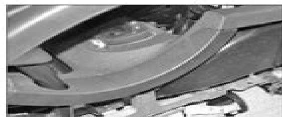
27.7 Prise up the panel beneath the handbrake lever