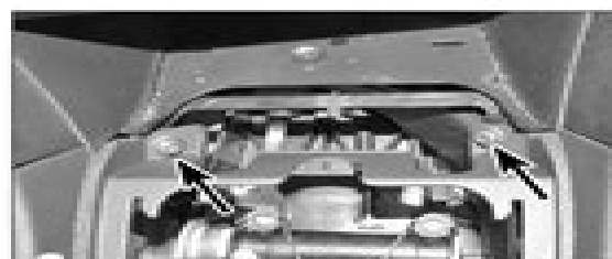
27.10a Undo the 2 Torx screws at the front of the console (arrowed) . . .