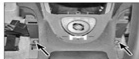
27.10b . . . and the screw each side (arrowed)