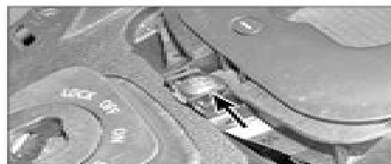
27.6a On automatic transmission models, undo the screw (arrowed) . . .