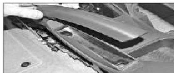
27.8a Lift up the cover . . .