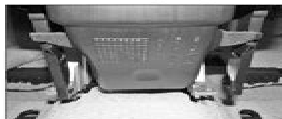
27.11a Lift the air duct from its mountings, and pull it rearwards