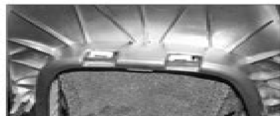
27.5 Unclip the gear lever gaiter/frame from the trim