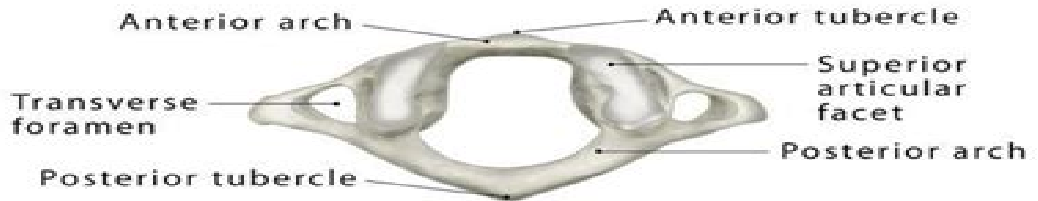
Superior view of C1 (Atlas)