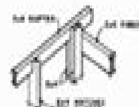
CORNER POST DETAIL