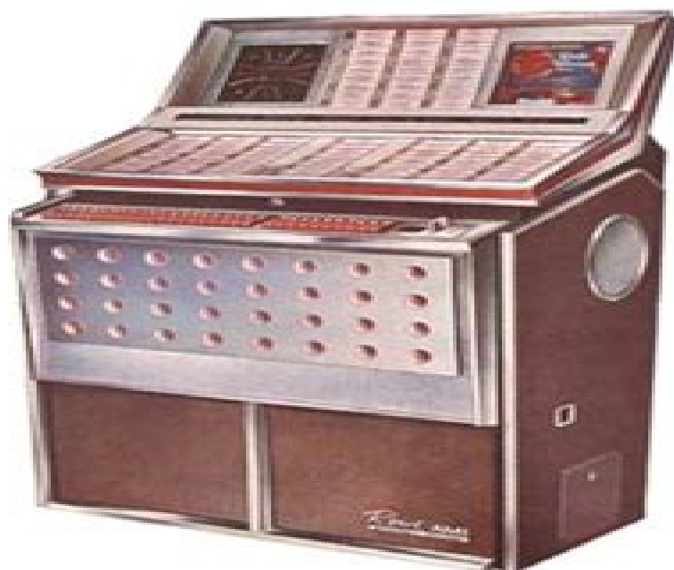
JBM - Tropicana 1964

ROWE AC MANUFACTURING Division of Automatic Canteen Company of America