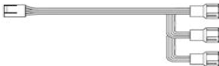
1 x 1-to-3 PWM cable