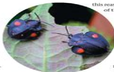
▲ Other organisms also benefit from photosynthesis

Photosynthesis nourishes almost the entire living world directly or indirectly. An organism acquires the organic compounds it uses for energy and carbon skeletons by one of two major modes: autotrophic nutrition or heterotrophic nutrition. Autotrophs are “self-feeders” ( auto- means “self,” and trophos means “feeder”); they sustain themselves without eating anything derived from other living beings. Autotrophs produce their organic molecules from \text{CO}_2 and other inorganic raw materials obtained from the environment. They are the ultimate sources of organic compounds for all nonautotrophic organisms, and for