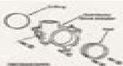
1.5L 16V engine The 1.5L 16V engine is a four-cylinder, 16-valve engine. It is a modern, efficient engine that provides excellent performance and fuel economy.

The 1.5L 16V engine is a four-cylinder, 16-valve engine. It is a modern, efficient engine that provides excellent performance and fuel economy. The engine is designed to provide excellent performance and fuel economy. The engine is designed to provide excellent performance and fuel economy. The engine is designed to provide excellent performance and fuel economy.