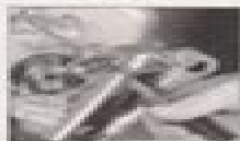
1.5L 16V engine The 1.5L 16V engine is a four-cylinder, 16-valve engine. It is a modern, efficient engine that provides excellent performance and fuel economy.