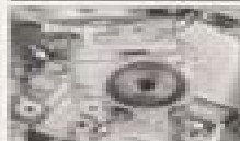
1.5L 16V engine The 1.5L 16V engine is a four-cylinder, 16-valve engine. It is a modern, efficient engine that provides excellent performance and fuel economy.