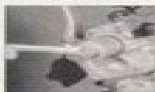
1.5L 16V engine The 1.5L 16V engine is a four-cylinder, 16-valve engine. It is a modern, efficient engine that provides excellent performance and fuel economy.