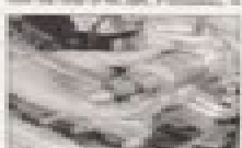
1.5L 16V engine The 1.5L 16V engine is a four-cylinder, 16-valve engine. It is a modern, efficient engine that provides excellent performance and fuel economy.

The 1.5L 16V engine is a four-cylinder, 16-valve engine. It is a modern, efficient engine that provides excellent performance and fuel economy. The engine is designed to provide excellent performance and fuel economy. The engine is designed to provide excellent performance and fuel economy. The engine is designed to provide excellent performance and fuel economy.