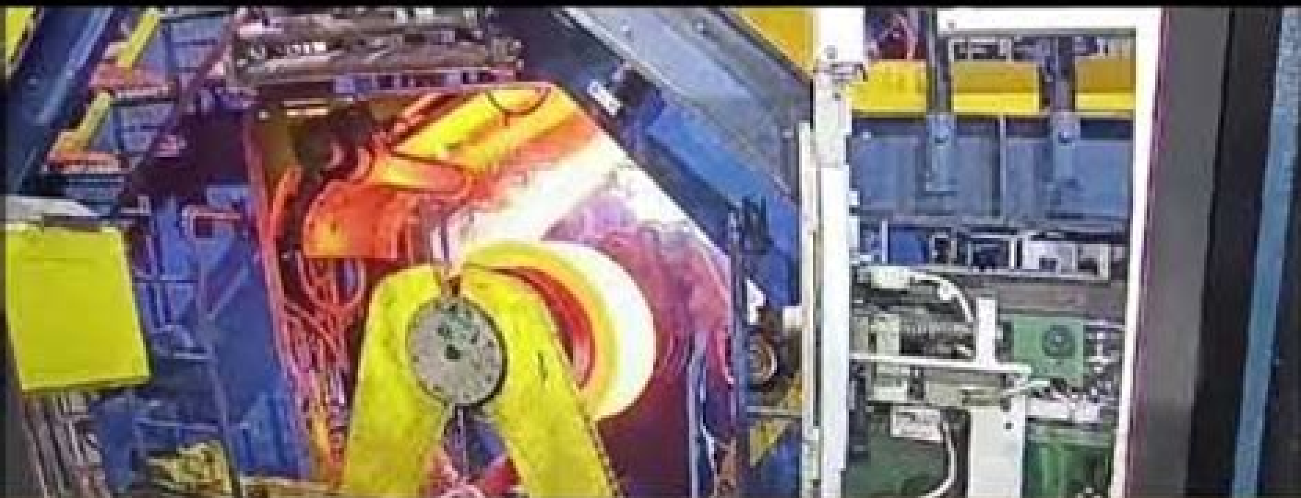
Scaw Metals Group Hot Strip Mill