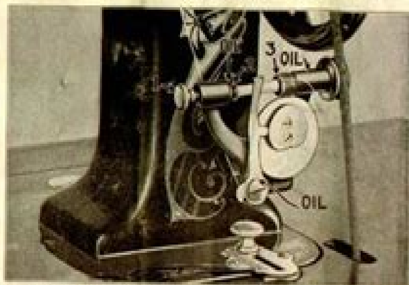
Figure 2. This shows how the automatic bobbin winder is turned into position with the small pulley in line with the belt pulley of the machine. Notice how the end of the thread is caught between the lower end of the bobbin and the winder (3) to hold the thread on the bobbin while winding.

Turn the automatic bobbin winder to the right until the small pulley is in line with the belt pulley of the machine and then put the belt over the small pulley as shown in Fig. 4. Now hold the hand wheel with your left hand and release the sewing mechanism by turning the brake button to the left as explained on Page 1. Now operate the treadle of the machine with the distributor arm of the bobbin winder in order to the right as it will go.