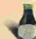
BARLEY WINE + Germany