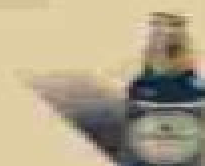
PILSNER + Germany