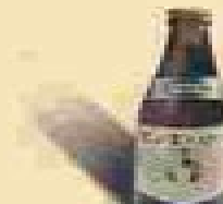
TRAPPIST ALE + Germany