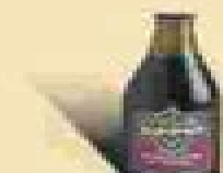
PORTER + Germany