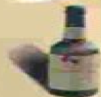
STRONG OLD ALE + England