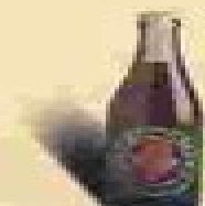
WHEAT BEER + Germany