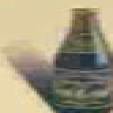
MUNICH-STYLE + Germany