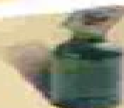
VIENNA-STYLE + Austria