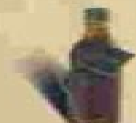
AMBER ALE + Germany