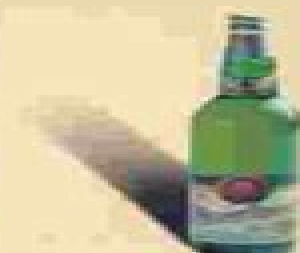
ORIGINAL PILSENER + Germany