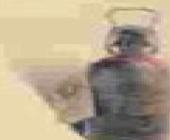
DOUBLE ROCK + Germany