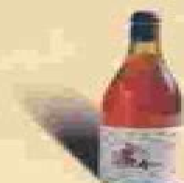
FRAMROSE + Germany