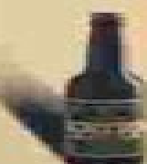
IRISH ALE + Germany