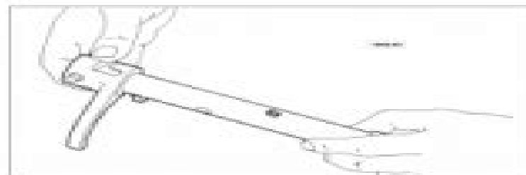
Fig. 20 - Removal of fork from control rod.