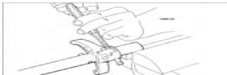
Fig. 19 - Removal of the fork retaining pin.