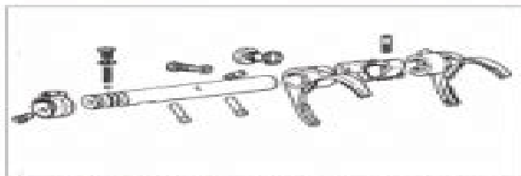
Fig. 17 - Components of inverter rod and fork as assembly for gearbox with minireduction.

On tractor equipped with a minireduction unit, repeat the above operations to remove the second selector fork.