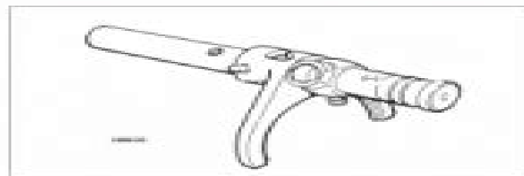
Fig. 18 - Rod and fork for gearbox without minireduction.