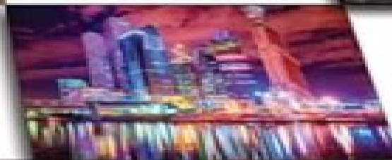
United States of America