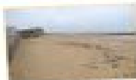
June Beach Landing

The Allies gained a foothold on continental Europe and