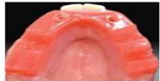
Fig. 3 Seat screw-retained block