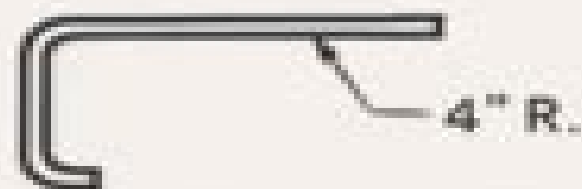
TYP. REBAR BEND