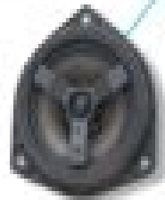
6.5" Coaxial Carbon Fiber Woofer