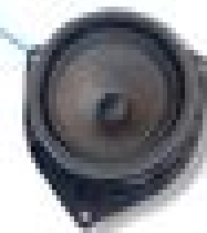
6.5" Carbon Fiber Woofer