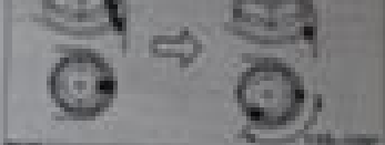
Figure 1: Showing the modelled sea level rise by the 21st century.