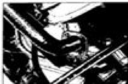
Fig. EB-12 Removing front tube

Remove the front, rear and the back pin, and remove the lever. (The operation is carried out in the previous compartment.)