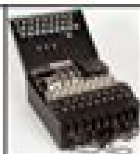
Enigma, machine used by Nazis to communicate