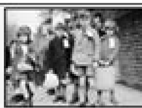
Children being evacuated out of London