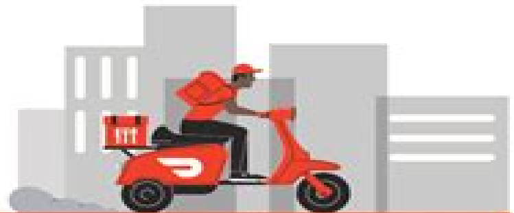
U.S. Monthly Market Share

Here's a look at the biggest players in the space, and how their market share has changed over the last few years.