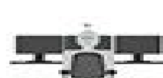
Number of Monitors Required