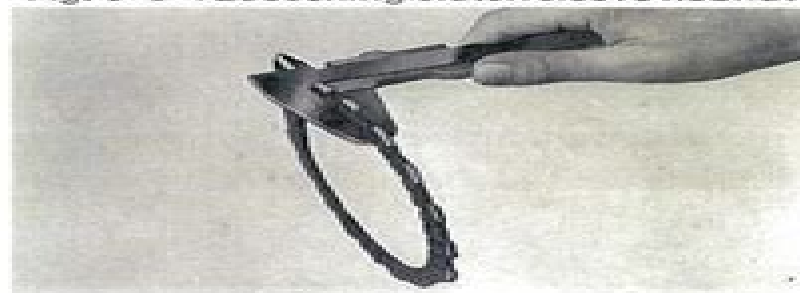
Fig. 6-6-2 Measuring cork plate thickness