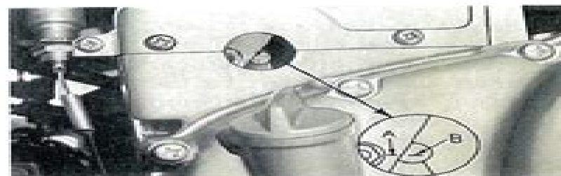
Fig. 6-5-3 Oil pump inspection marks