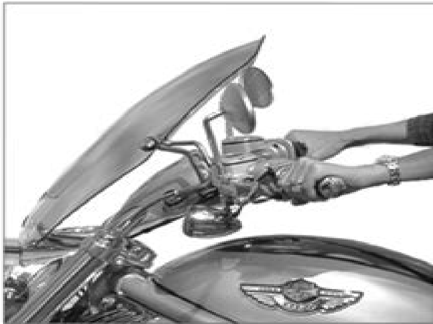
With stock brackets installed