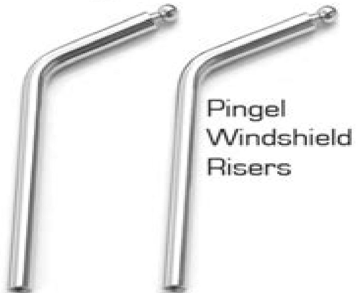
Pingel Windshield Risers