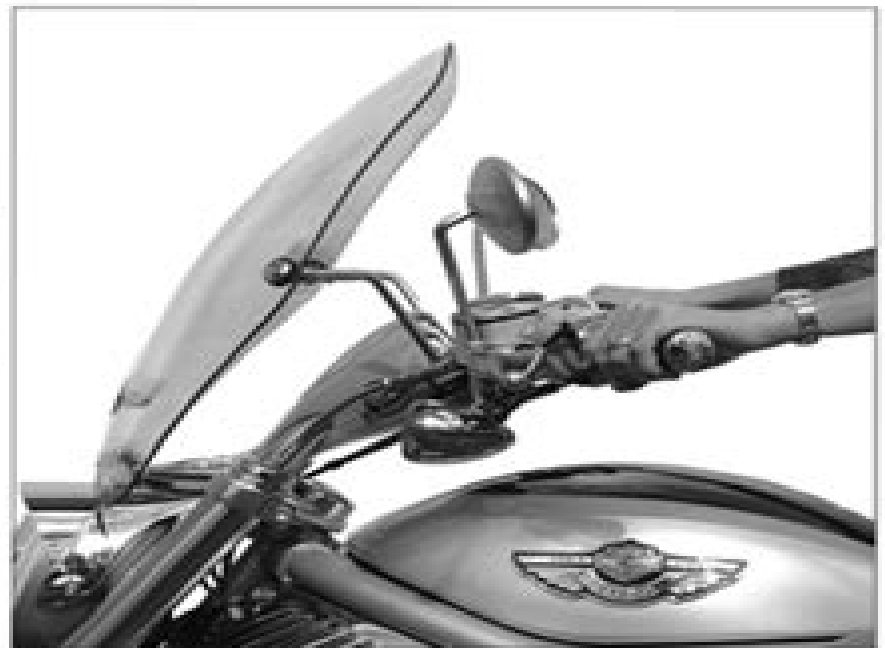
With Pingel Risers Installed