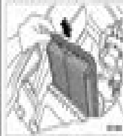
3. Remove the air cleaner element