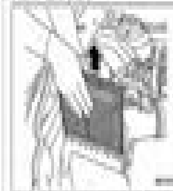
2. Open the air cleaner cover and remove