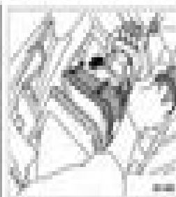
2. Open the air cleaner cover