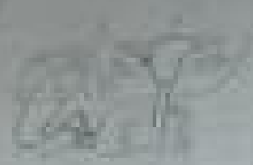
FIG. 10-10 Solenoid valves