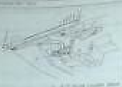
FIG. 10-11 Solenoid valves