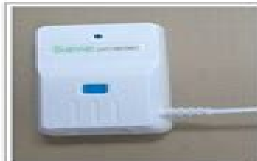
Gas transmitter + connecting wire & plug