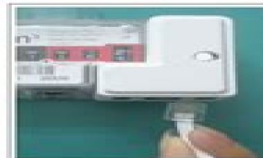
Gas pulse sensor- type A (Shown already attached to an Actaris meter)