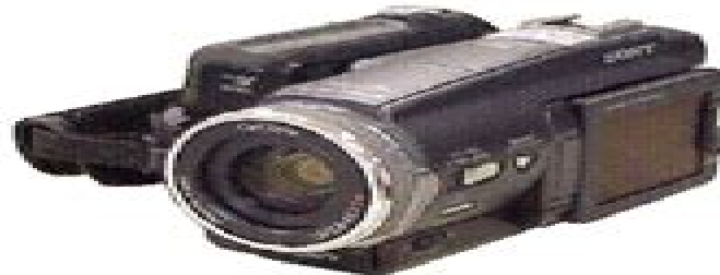
Photo : DCR-HC1000