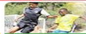
Mamelodi Sundowns dominates Moselle Cup Page 16