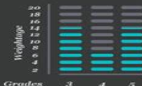
Measurement and Data (MD)