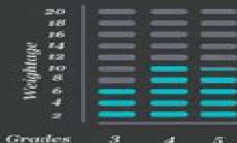
Number and Operations in Base 10 (NBT)