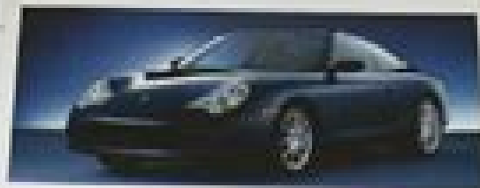
Owner's Manual Boxster