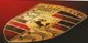
Service and Customer Information