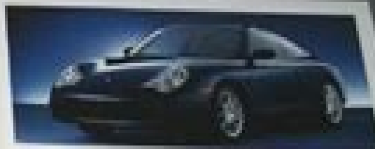
Quick Reference Guide Boxster