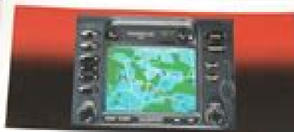
Porsche CarConnect infotainment Management (PCM)