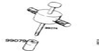
Puller for injectors