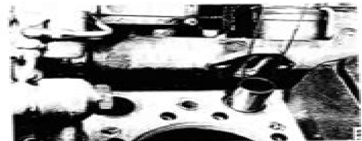
Valve tappets removed