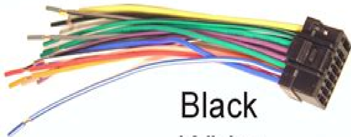
Alpine - 16 Pin